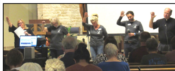
Just Pray Reflection Evening