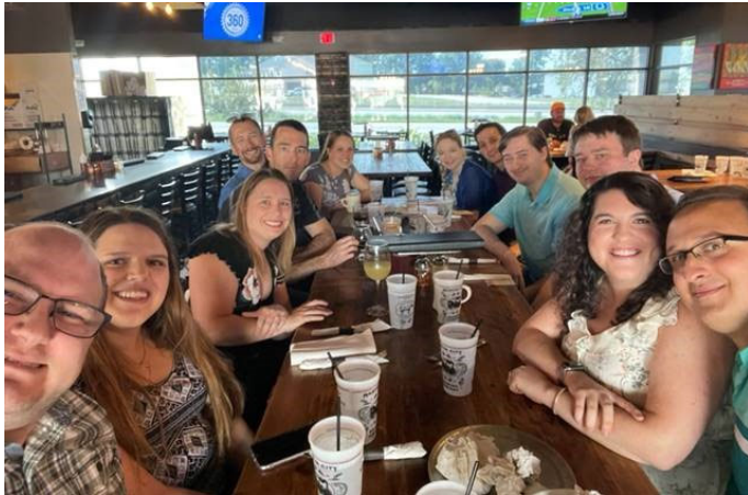
Young Adults Brunch After Mass (B.A.M.)

High School teens are invited to spiritual, social and service opportunities every month. High School Nights are held every Third Sunday night (6-8pm). All are welcome to participate in Contemporary Mass every Fourth Sunday at the 12 Noon Mass with other middle and high school youth. Teens are invited to share their gifts on the High School Youth Ministry Leadership team. Leaders help plan and facilitate High School Nights, Confirmation small groups and Middle School activities. Team meetings are every Second Sunday, 6:00 to 7:30pm. Other opportunities for high school youth include discipleship groups, service mission trip, Service Saints service opportunities, national and local conferences and social community building events. Adult leaders (including parents) are welcome too. Build life-long, meaningful friendships rooted in Christ!